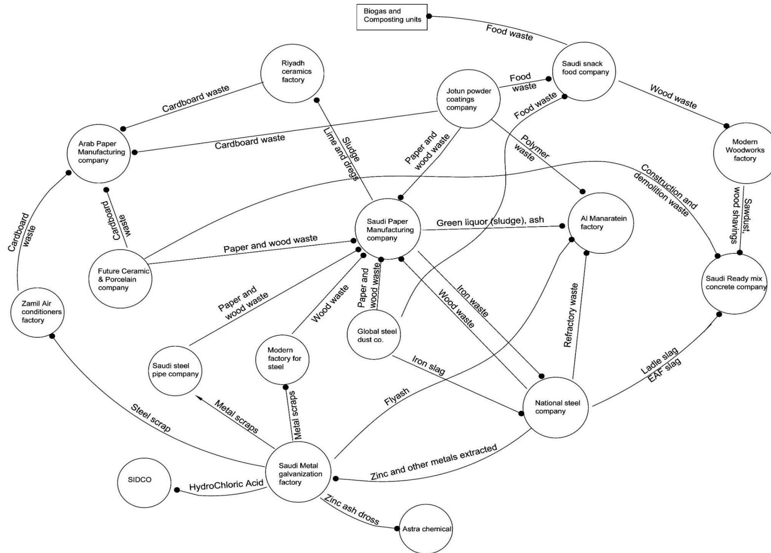
Figure 4 Industrial Symbiosis between the 20 industries